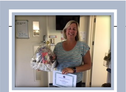
Le-arna Koru Kindergarten